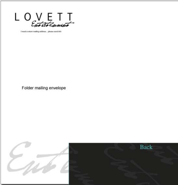
Folder mailing envelope